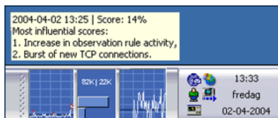
The unique InJoy Firewall Deskbar application.

A HOT NEW DESKBAR application (for MS Windows ONLY) now enables you to casually keep an eye on the "intrusion score", while preserving desktop space for other work. You can even use the TOOLBAR to monitor remote firewalls.