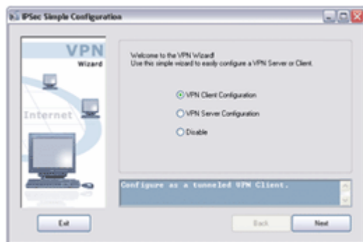
The simple VPN Wizard for quick VPN configuration.

InJoy Firewall™ is the ONLY Firewall in the security market that offers a total end-to-end multi-platform software solution. It solves the overwhelming problems related to managing multi-vendor security devices, now making it easier than ever to build enterprise-wide IPSec VPNs and set up identical cross-platform end-point security.