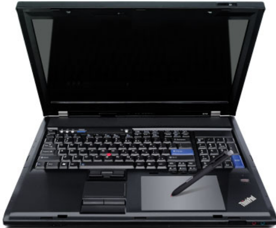
Lenovo ThinkPad W700