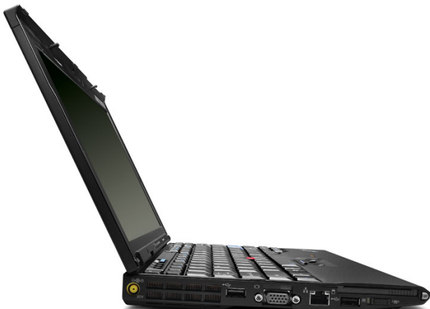
Lenovo ThinkPad X200