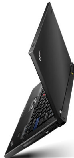
Lenovo ThinkPad T400