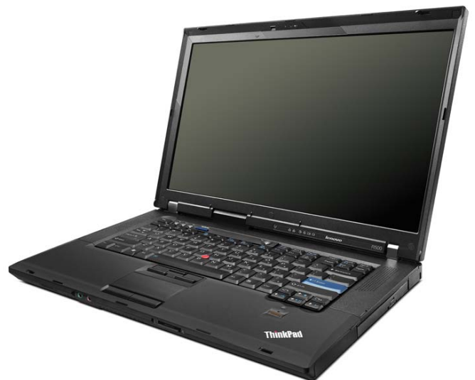
Lenovo ThinkPad R500