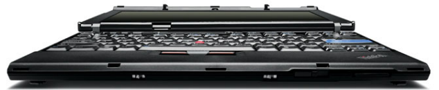
Lenovo ThinkPad X200s