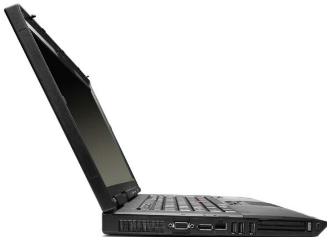
Lenovo ThinkPad R500