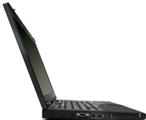
Lenovo ThinkPad T400