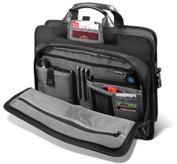
ThinkPad Business Topload Case part number 43R2476