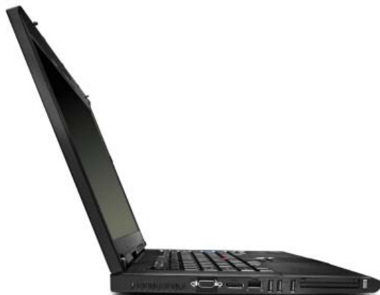
Lenovo ThinkPad W500