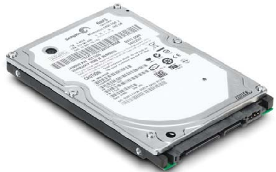
160GB Disk 9.5mm SATA 1.5Gb/s (7200 rpm) 41N5737