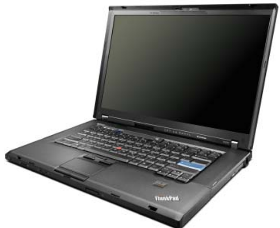
Lenovo ThinkPad W500