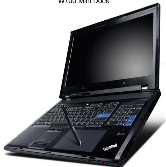
Lenovo ThinkPad W700