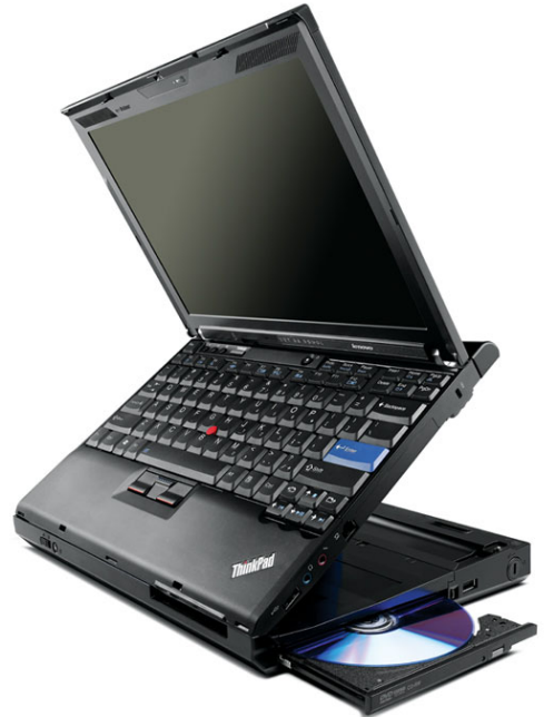
Lenovo ThinkPad X200 with optional X200 UltraBase, DVD Burner, and 9-cell Battery