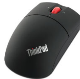
Laser Tilt Wheel Travel Mouse (Bluetooth) 41U5008