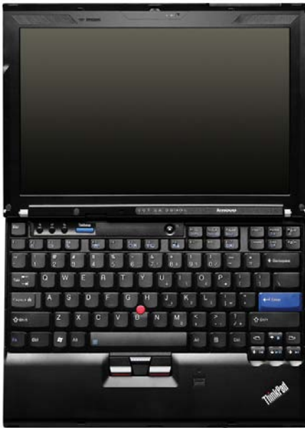
Lenovo ThinkPad X200