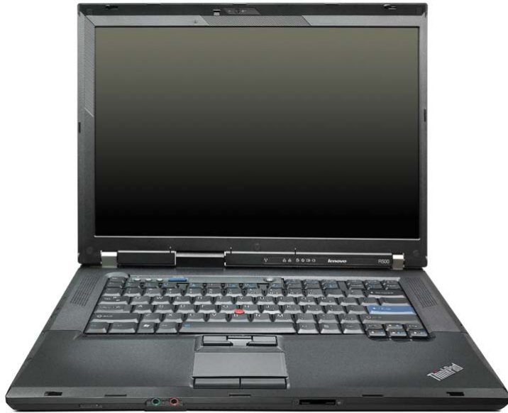
Lenovo ThinkPad R500