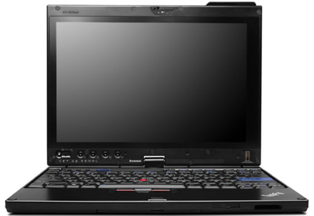
Lenovo ThinkPad X200 Tablet with frameless screen for pen