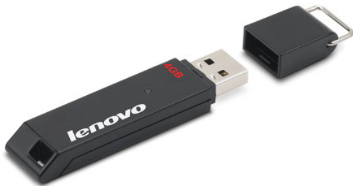
USB 2.0 Security Memory Key 4GB 41U5120