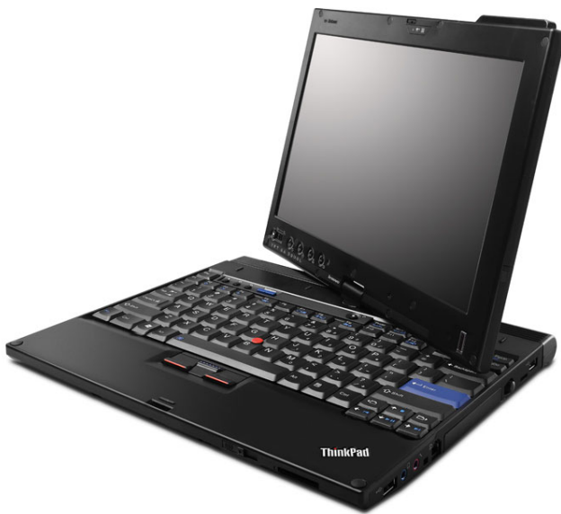
Lenovo ThinkPad X200 Tablet with touchscreen for finger and pen