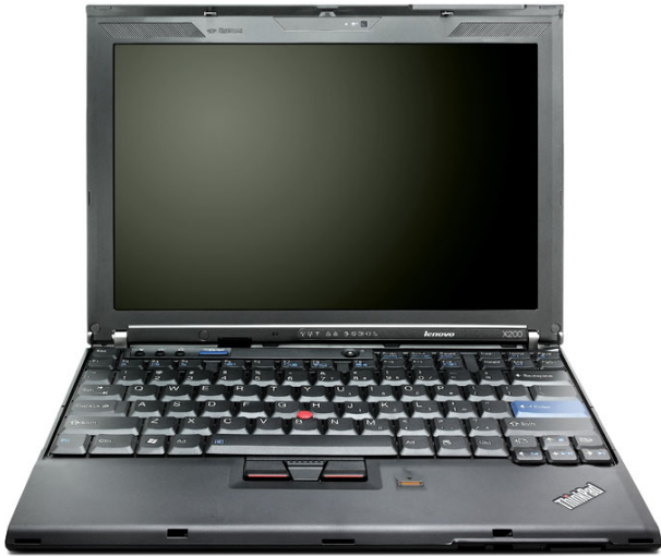
Lenovo ThinkPad X200s