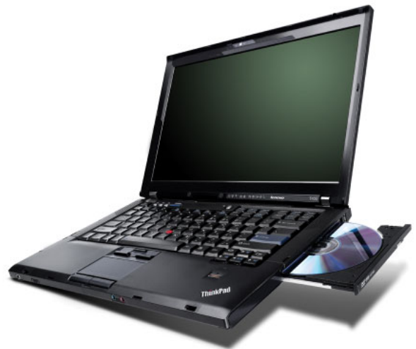
Lenovo ThinkPad T400